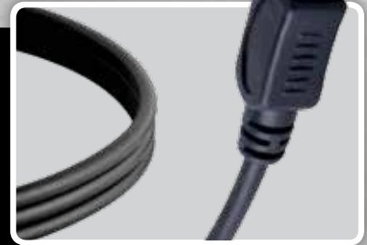
IEEE 1394 4 PIN