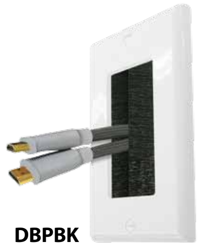
DBPBK (Black Brush)