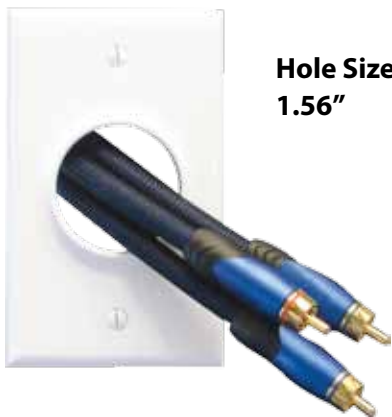
Hole Size 1.56"