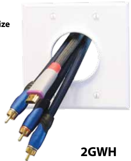
Hole Size 1.8"