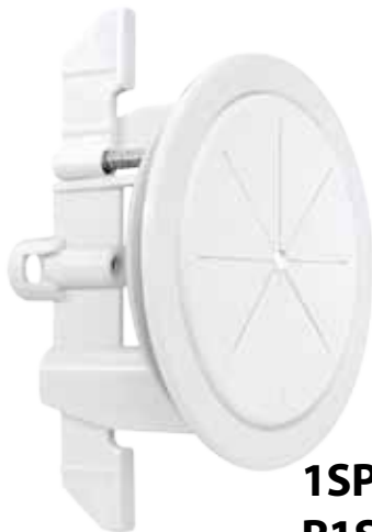
Plate Size 2\frac{5}{16}'' Hole Size 2"