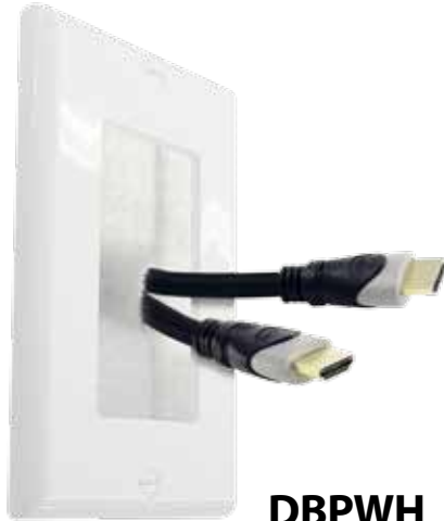
DBPWH (White Brush)