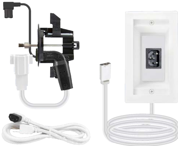
C7HS-W (White) C7HS-B (Black)