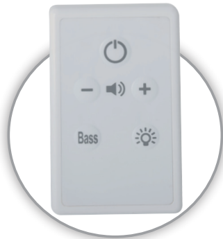
Remote and on board function controls