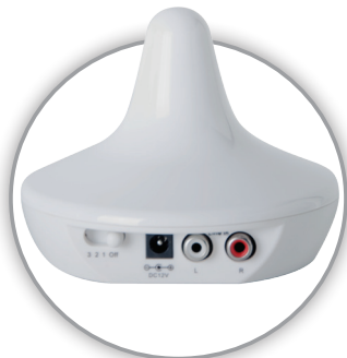
3 channel selection for up to 150 feet of clear transmission