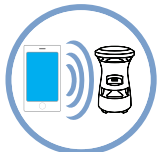
Smart phone control through laptop/PC