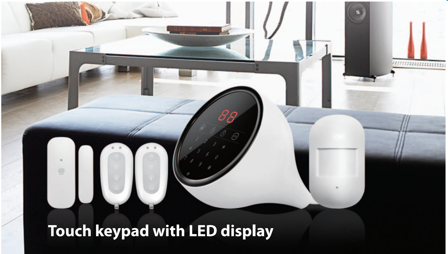
Touch keypad with LED display