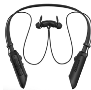
Nbees Bluetooth Neckband Headphone