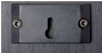
Wall hanging bracket on center channel and all bookshelf speakers

The sonically balanced and luxurious Forte series delivers high-end sound to please audio lovers and cinema buffs equally.