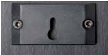
Wall hanging bracket on center channel and all bookshelf speakers

The sonically balanced and luxurious Forte series delivers high-end sound to please audio lovers and cinema buffs equally.