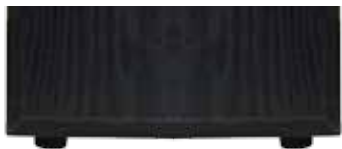
Anti-vibration rubber feet eliminate cabinet vibrations