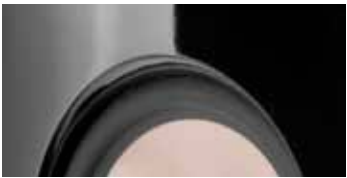
High gloss front baffles