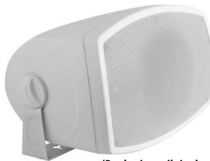
(Dual voice-coil single stereo speakers)